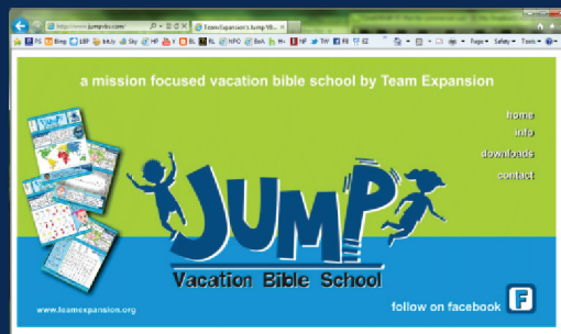
The website of Jump VBS is up and ready for downloads!