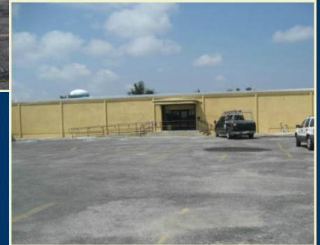
Above - Dilapidated bowling alley. Below - Transformed building into The Gathering Place, home of community events, youth outreach, counseling and more.

they will start meeting there for worship and biblical instruction. If you would like to learn more about this work and how they began, look for the upcoming issue of TELL. If you are on our paper mailing list, you will get one in the mail. When it is ready, you can also get a pdf version at Team Expansion's website by going to http://bit.ly/tellmag . There you can also read previous issues. On the back side of this newsletter you can see some of my illustration work for this article. To find out even more about The Gathering Place you can go to there website at http://bit.ly/gccnews . Thanks for partnering with us!