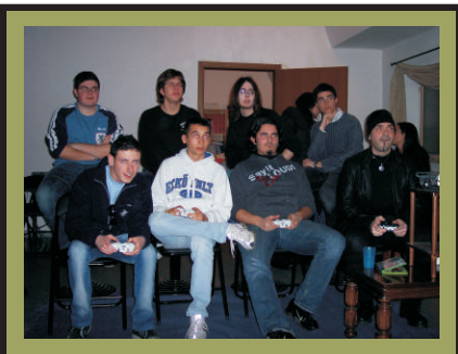
Here is a picture from our March Video Game night. Everyone in this picture is an Italian who came to the event. The story is on page two.

in September, while there was not a big response, it brought four new people that have continued coming to other events since then. At the September Video Game Night, there were a total of seven visitors. This time, we had some local support behind it. A video game store owner brought some of his stuff and a friend, who owns a pizzeria, donated several pizzas to our event. He is a nominal muslim. We ended having a totally unexpected response. Twenty-eight