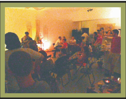
Our June Coffee House set another record of visitors. There were forty-four visitors, many of whom had never come to anything before.